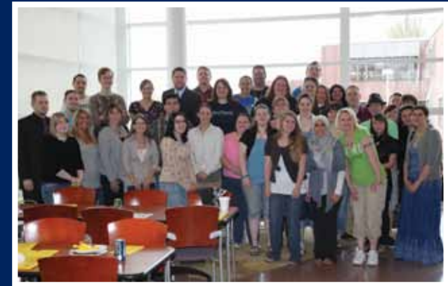
Students gather for a picture at Boast and Brunch, a year-end awards event that recognizes the most outstanding student organizations and individuals.