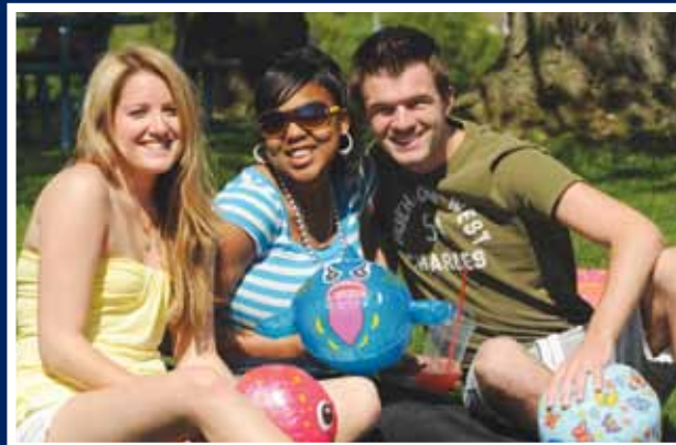
Friends relieve the stress of final exams by participating in Kentiki festivities.