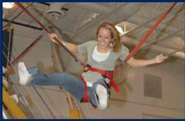
A student flies high on a bungee, one of the many fun activities offered at Kentiki, Kent State Stark's spring Student Life event.