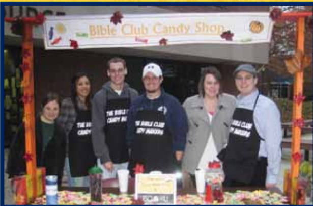
Members of a student organization pass out candy at Kent State Stark's fall festival, Boo U.