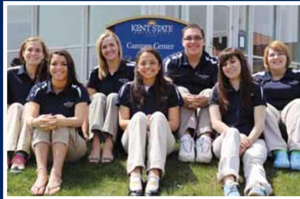
Student Ambassadors gather together for a photo outside the Campus Center.